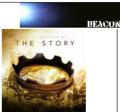
The Story – This Week – Chapter 2 "God Builds a Nation"

The Sanctuary is open for prayer and meditation on Tuesday, Wednesday and Thursday from 10am to 3pm.